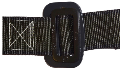
Mating Buckle Closed