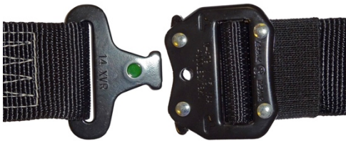
Bayonet Buckle Open