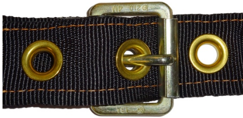
Grommet and Tongue